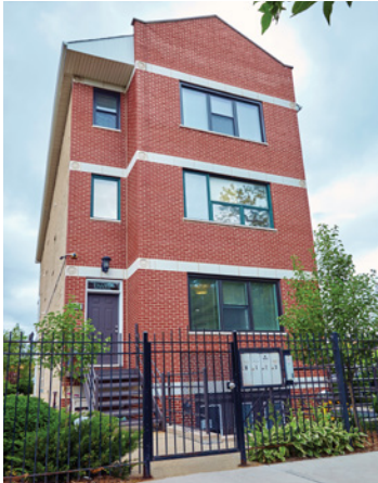
Brooke Whitted Center (BWC)